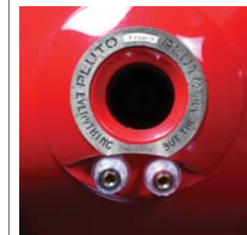
Reflex Port and Speaker Terminal: Back Panel (Pluto Bookshelf)