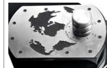
Level Controller: SubTerranean Subwoofer