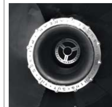
Bass Reflex Port: SubTerranean Subwoofer